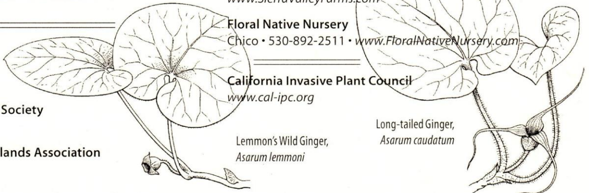
Lemmon's Wild Ginger, Asarum lemmoni