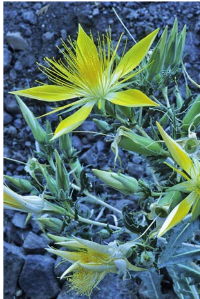
Giant Blazing Star