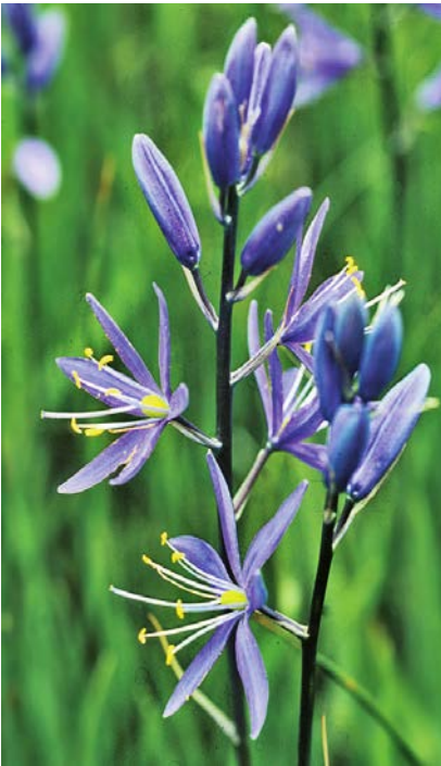
Common Camas Lily

Redbud Chapter, California Native Plant Society