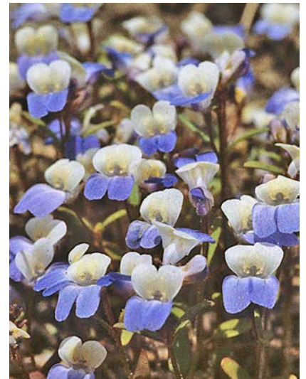
Torrey's Blue-eyed Mary

“Those who contemplate the beauty of the earth find reserves of strength that will endure as long as life lasts.”