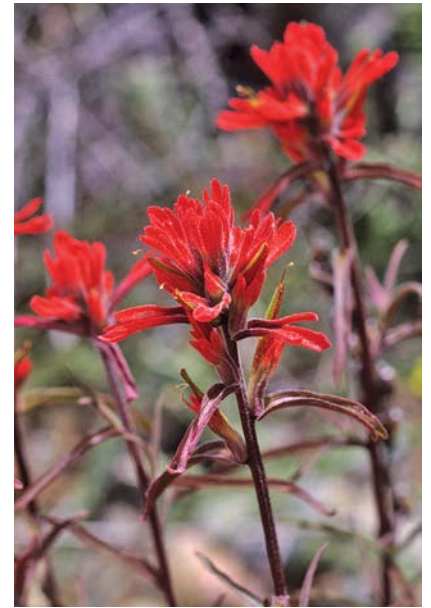
Frosty Paint Brush

“In this labor of love, experts give us a personal guide to fantastic flowers and spectacular botanical destinations. Whether you read it in a comfortable chair or perched in a foothill meadow, you will find this book more than a guide to the flowers. It is a treasure map that leads you to a wild California that heals, refreshes and inspires.”